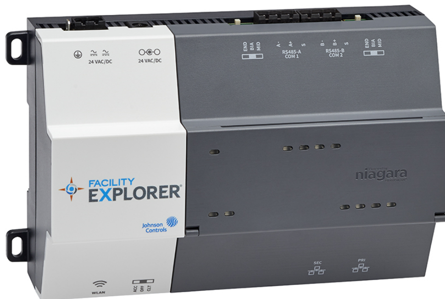
Figure 1: FX80 Supervisory Controller

In addition, the FX80 controller's hardware and software design is modular, so you can plug in accessories, such as communications option modules, if needed. The device and point licensing options allow you to select the device and point capacity most appropriate for the size of your facility and those options best needed to control it. And, in many cases, future expansions do not require the replacement of hardware.